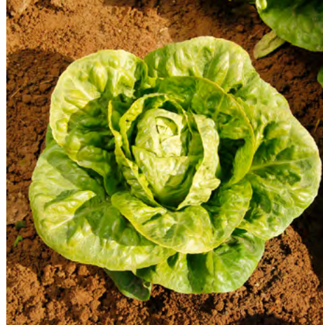
LITTLE GEM THINKER