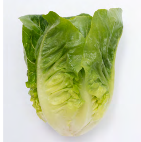
LITTLE GEM THEMES