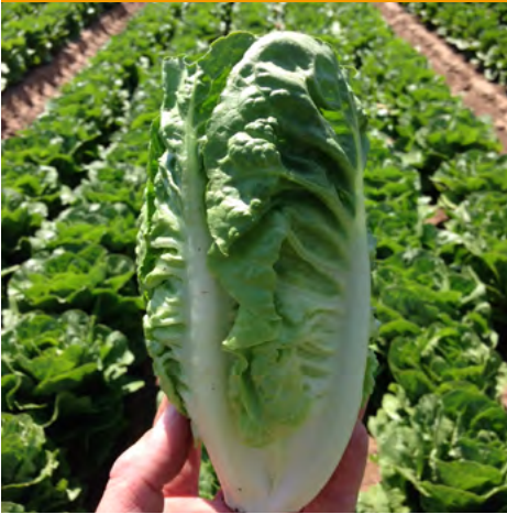
MINI ROMAINE THIMBLE