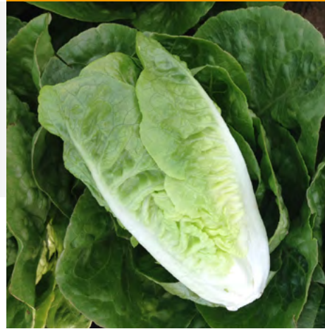
MINI ROMAINE RUGBEE