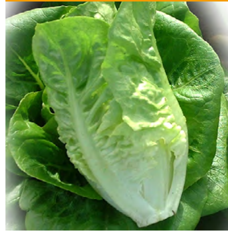
MINI ROMAINE SPLASHBEE*