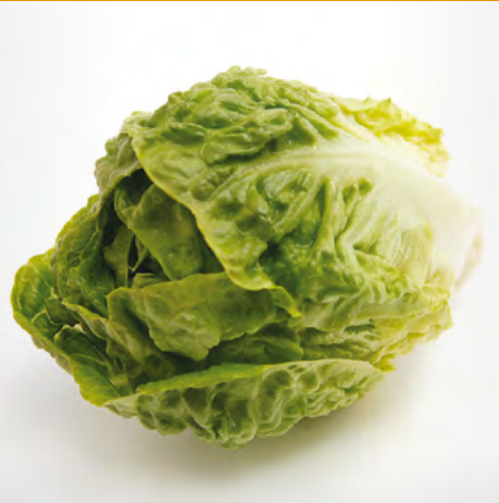
LITTLE GEM THUMPER